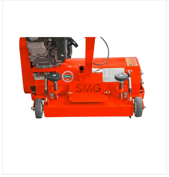
Rotating shaft with flexible tines