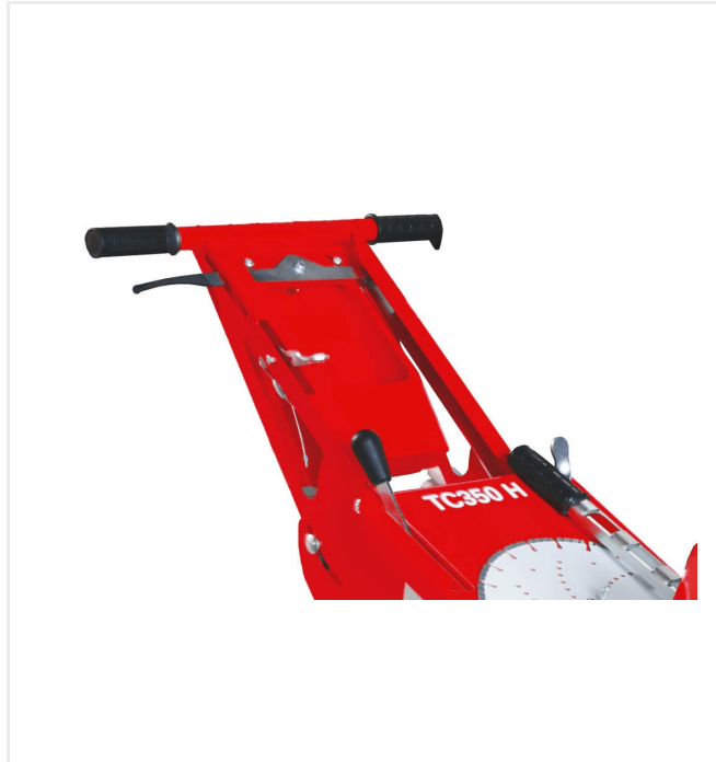
Hydraulic infinitely variable gearing