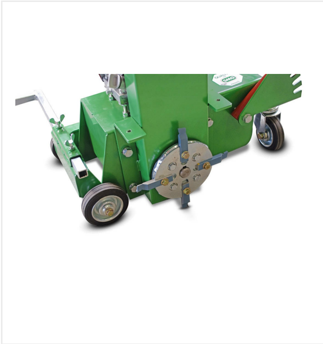
Cutter head with 4 hard metal knives