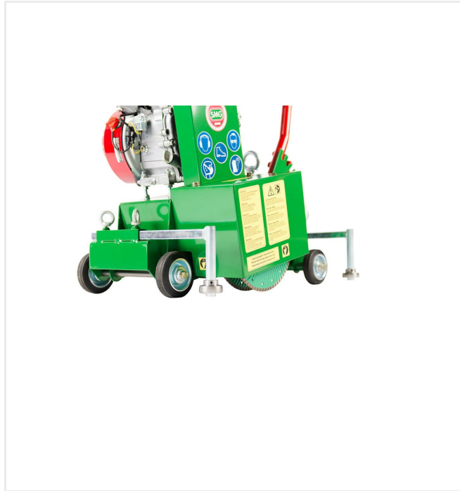
Groove Cutting Machine TF50

TF50 cuts grooves for marking lines for plastic profiles. For this reason, it is equipped with two separate markers. The working depth is infinitely adjustable. The exact cut is ensured by a dipstick and two rollers.