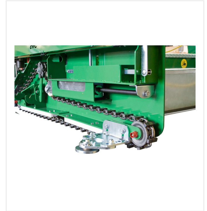
Repulse wheel for the installation alongside border stones