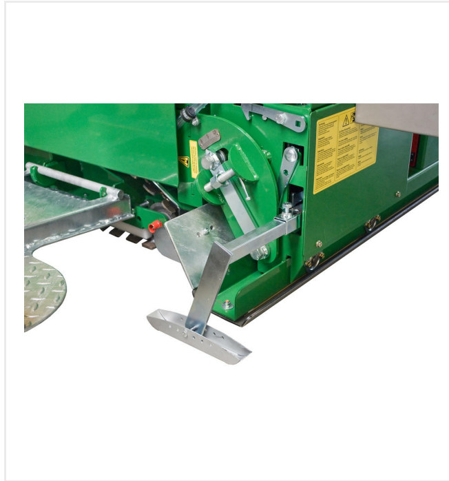
Integrated height levelling for evenly flat installation