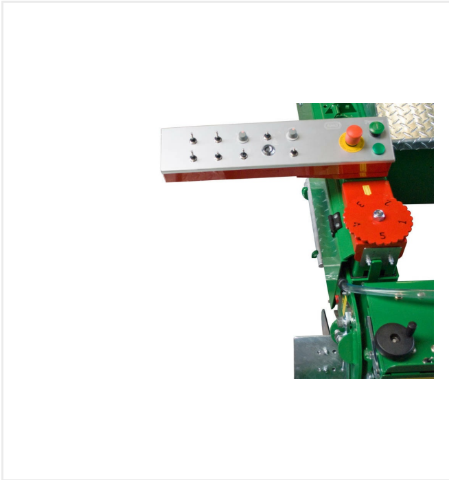
Control panel, on both sides