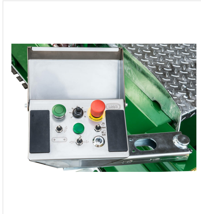
Detachable control panel for left and right