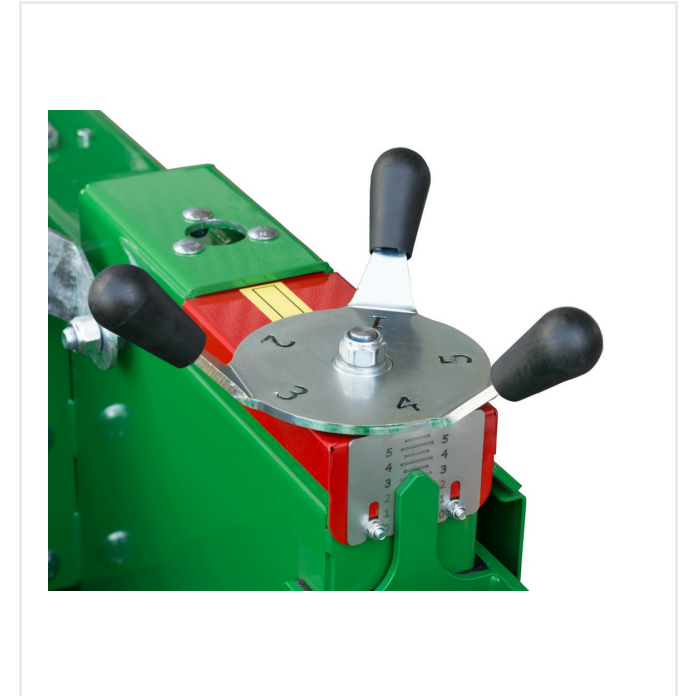
Manual handwheel for adjusting the installation thickness