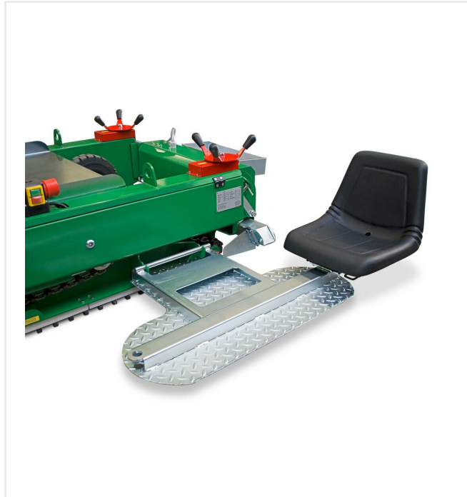
Seat plate, with adjustable seat, fits on both sides, for the transport pivoted