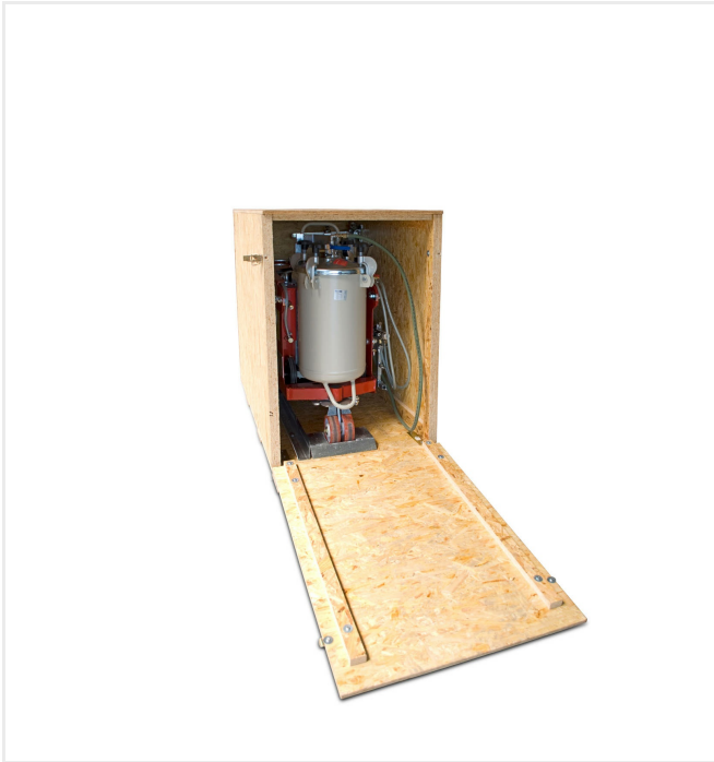
Compact SMG transport crate with fixing points