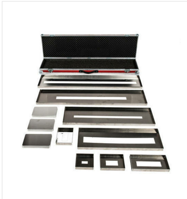
Mark stencils set for running tracks