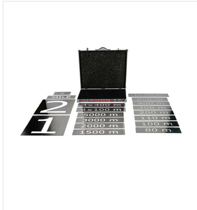
Letter stencils set