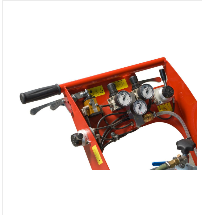
Pneumatic control of all functions, clearly arranged