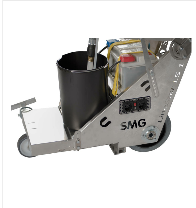
Driven by 12V vehicle battery (not in the scope of delivery)