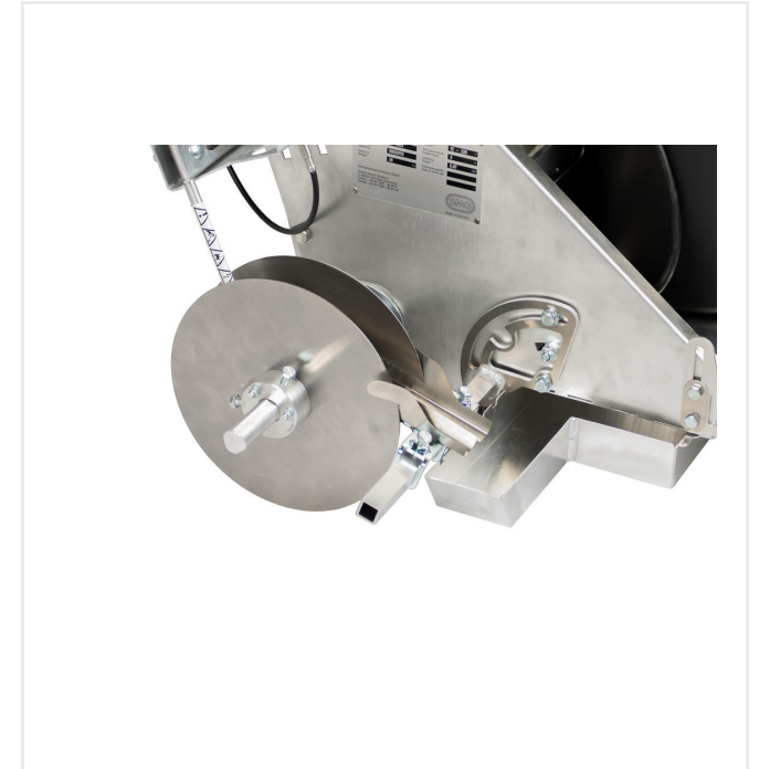
Striping unit and drip pan